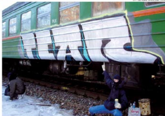
Iron 2007