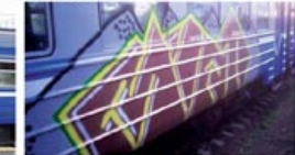
MIA (2011) / Minsk 2007

NO: Beer without vodka is a waste of money!