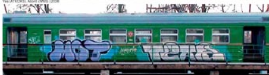
MCJ (DY DAREK), FEAR (PIS) | 2007