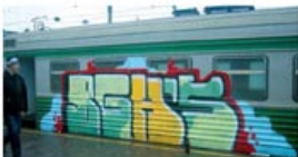
Nov (2011) / Minsk 2007