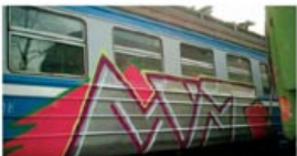
Nov (2011) / Minsk 2007