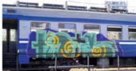
Kuis (2011) / Minsk 2007