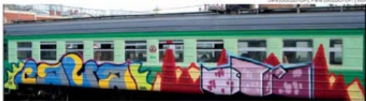
LEW (GOLDA/OP), PINE (PINKA) | 2007