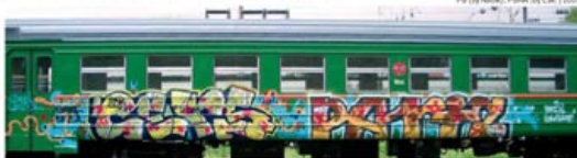
LEW (GOLDA/OP), PINE (GOLDA/OP) | 2007