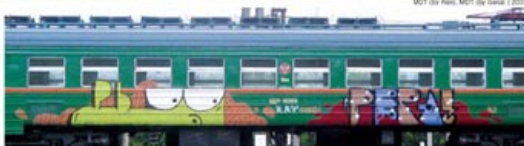
FB (DY NAROCKI), PINKA (DY LAC) | 2007