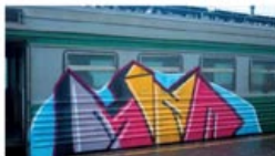
Nov (2011) / Minsk 2007