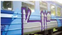
Kuis (2011) / Minsk 2007

PKer: I was different! There were no regulations,