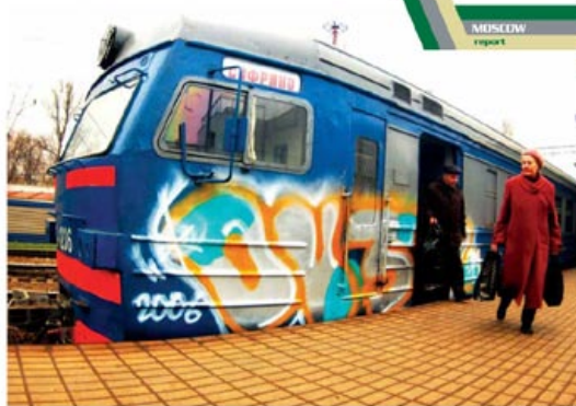
ONY (by Alaka Arts & Coe) 2008