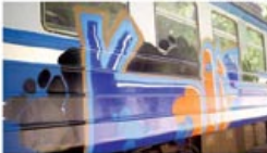
Kuis (2011) / Minsk 2007

everybody used to be in contact and knew each other! No show off, fashion and shit.