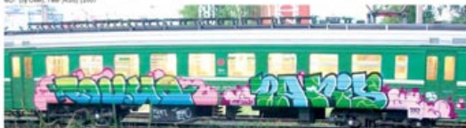
TWO (ATKOCKI), PINE (GOLDA/OP) | 2007