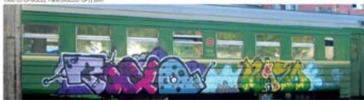
TWO (ATKOCKI), PINE (POT) | 2007