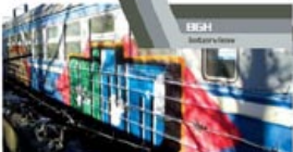
Kuis (2011) / Minsk 2007