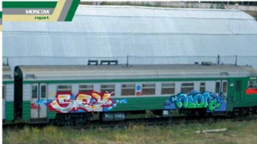
TWO (ATKOCKI), AZARD (WIS) | 2008