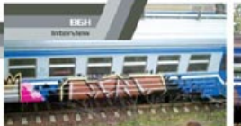
Nov (2011) / Minsk 2008