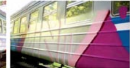
Kuis (2011) / Minsk 2007