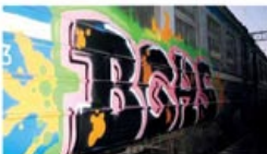
Nov (2011) / Minsk 2007