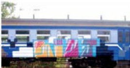
MIA (2011) / Minsk 2007